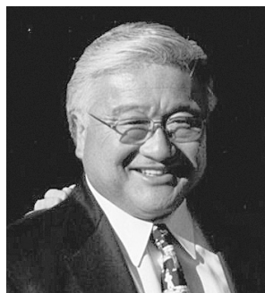
Guest of Honor: Congressman

a nonprofit public benefit corporation • Tax ID Number: 94-3304171 • www.indocommunity.us