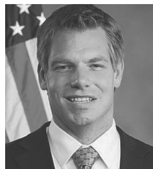
Guest of Honor: Congressman